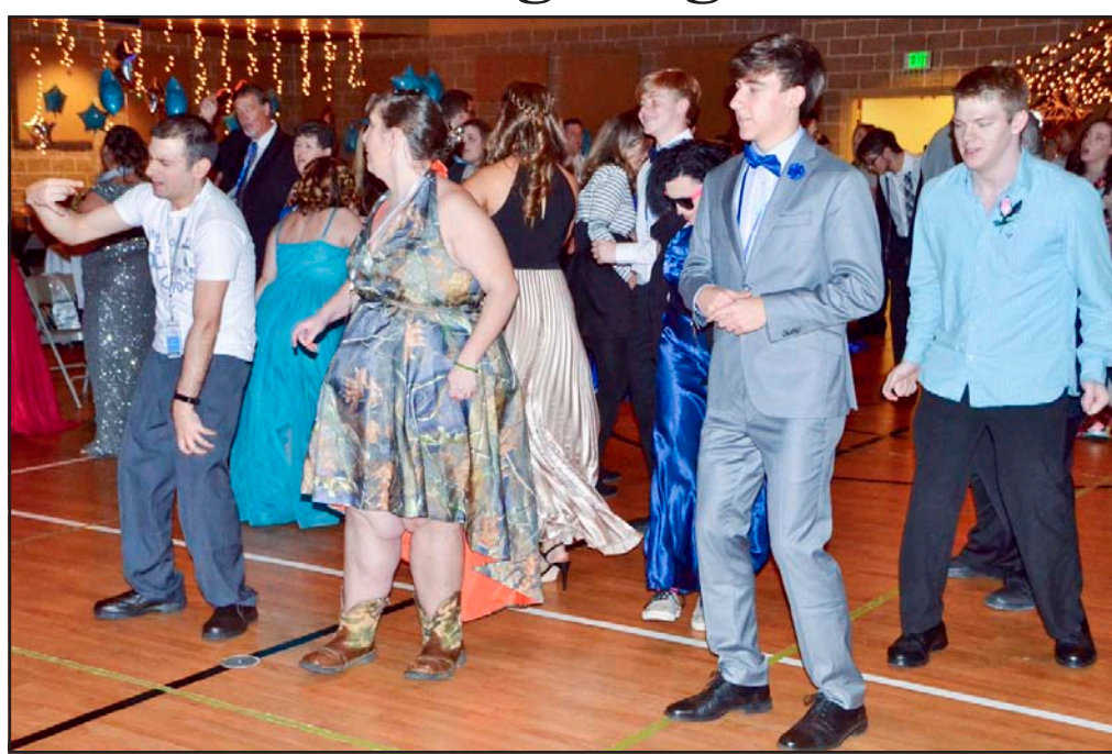
Area special needs residents had the time of their lives Friday night during the annual Night to Shine event at First United Methodist Church of Union County.