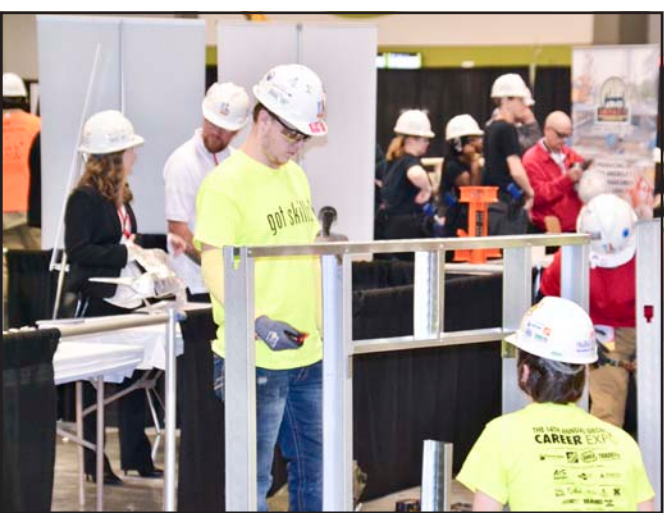
Woody Gap students have competed at a high level for several years in SkillsUSA competitions, as pictured here in 2018.