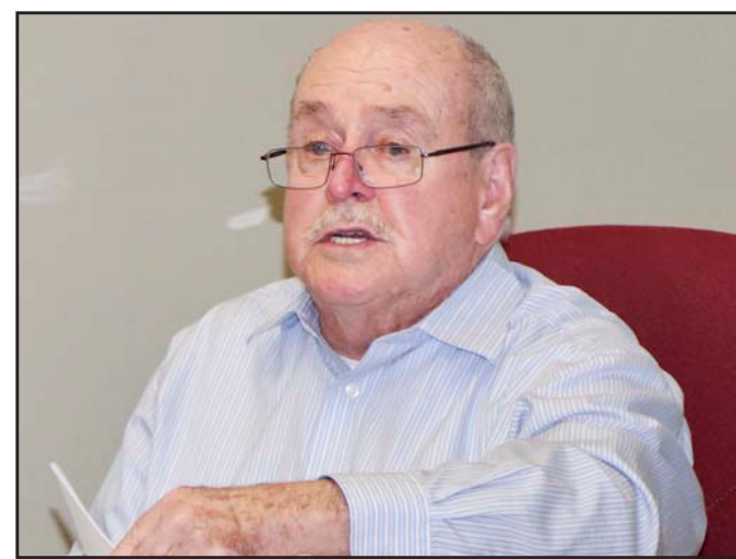
Blairsville Mayor Jim Conley