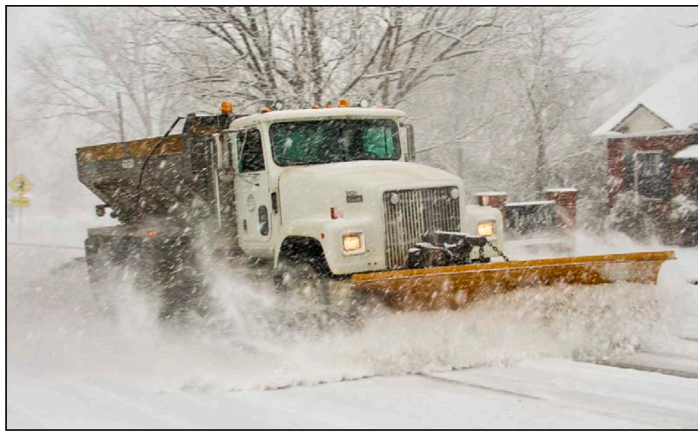
A county road truck plowing snow and spreading salt/gravel along Cleveland Street on Saturday morning.